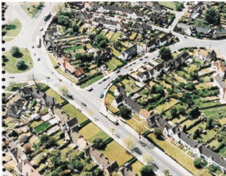
Image 7 - Aerial photograph, looking south west. Well Hall Road roundabout at left, with Well Hall Road running to bottom right; junction with Dickson Road at centre of photograph.