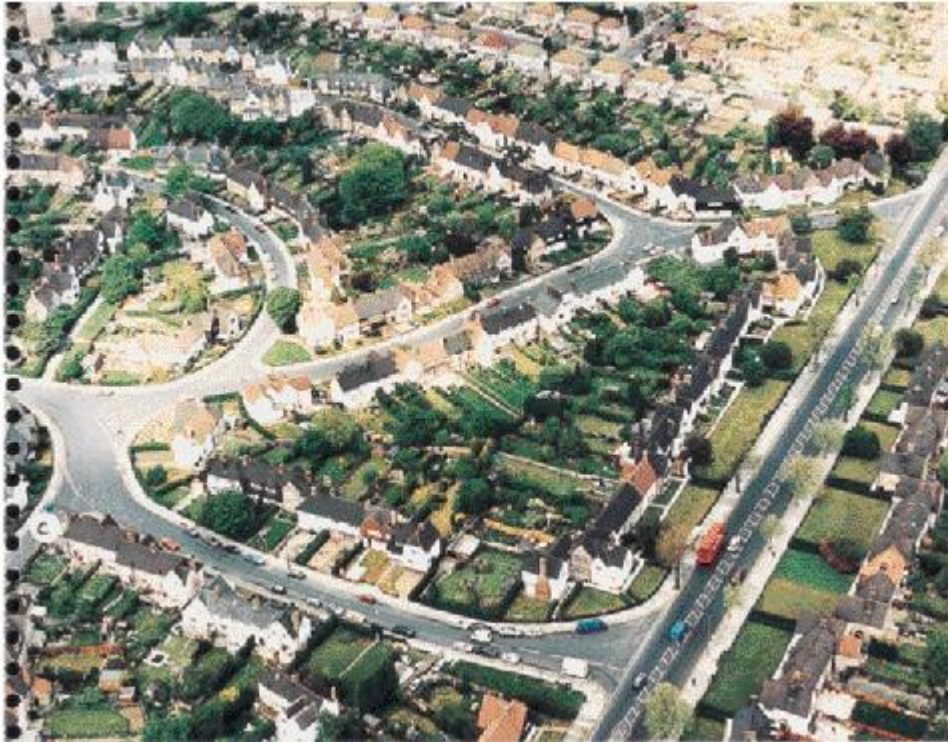
Image 6 - Aerial photograph, looking north. Well Hall Road running from bottom right to upper right; junction with Dickson Road bottom centre